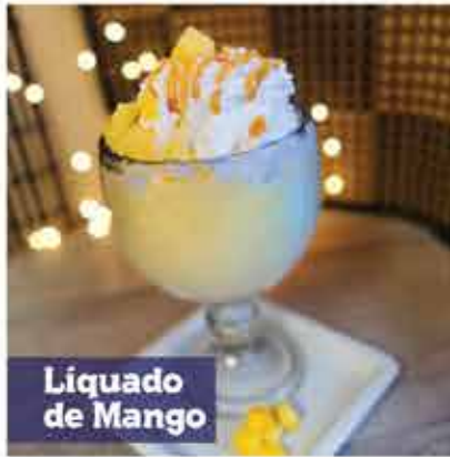
Liqueado de Mango