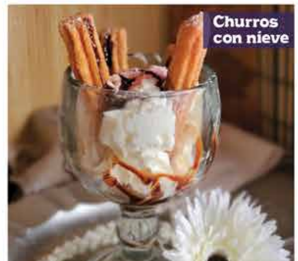
Churros con nieve