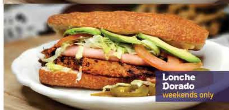
Lonche Dorado weekends only