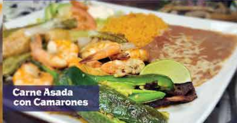
Carne Asada con Camarones