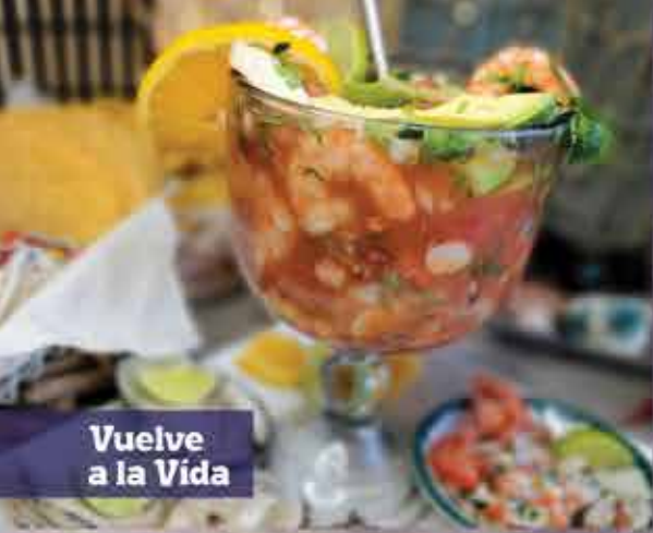
Vuelve a la Vida