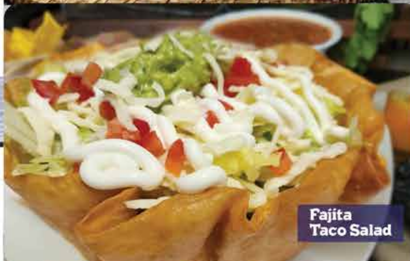
Fajita Taco Salad