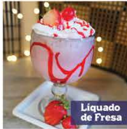
Liqueado de Fresa