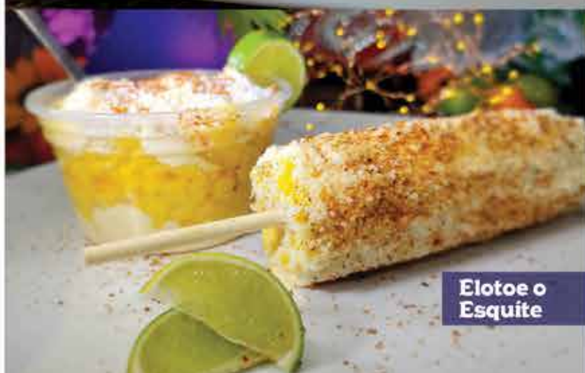
Elote o Esquite