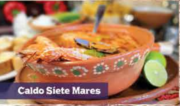
Caldo Siete Mares