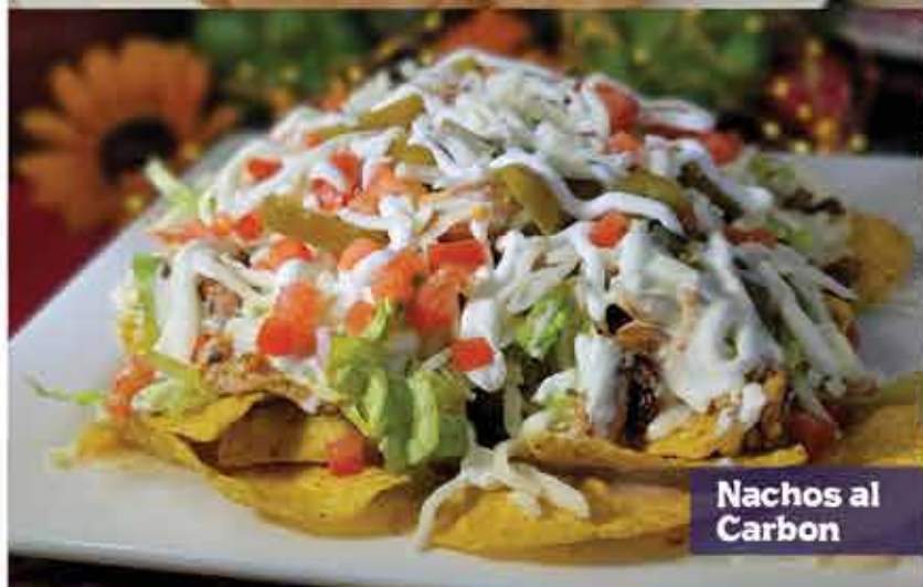
Nachos al Carbon