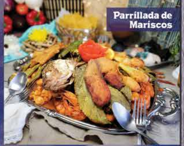
Parrillada de Mariscos