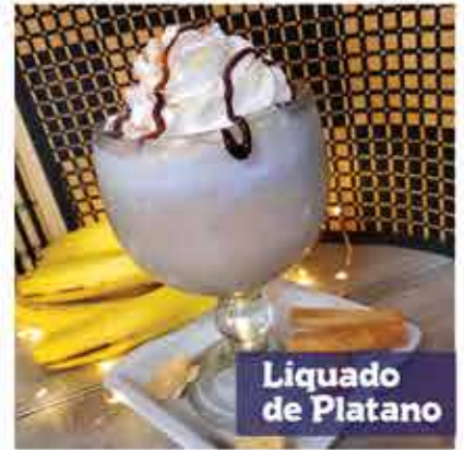
Liqueado de Platano