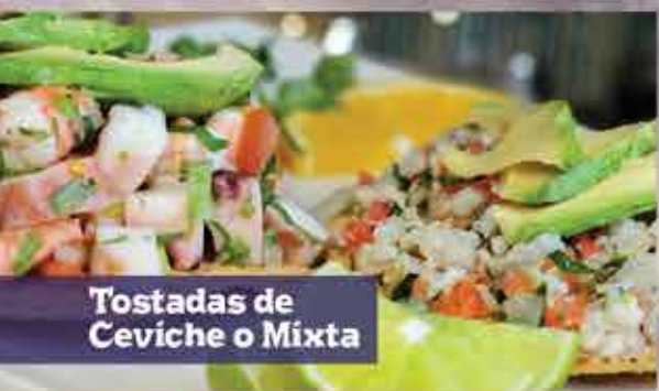
Tostadas de Ceviche o Mixta